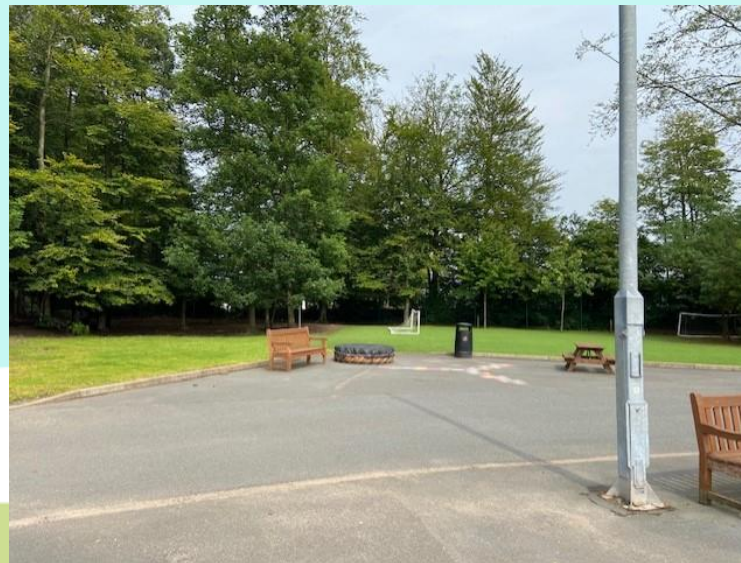
Woods and Fake Grass