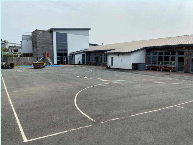
Pitch and Slide