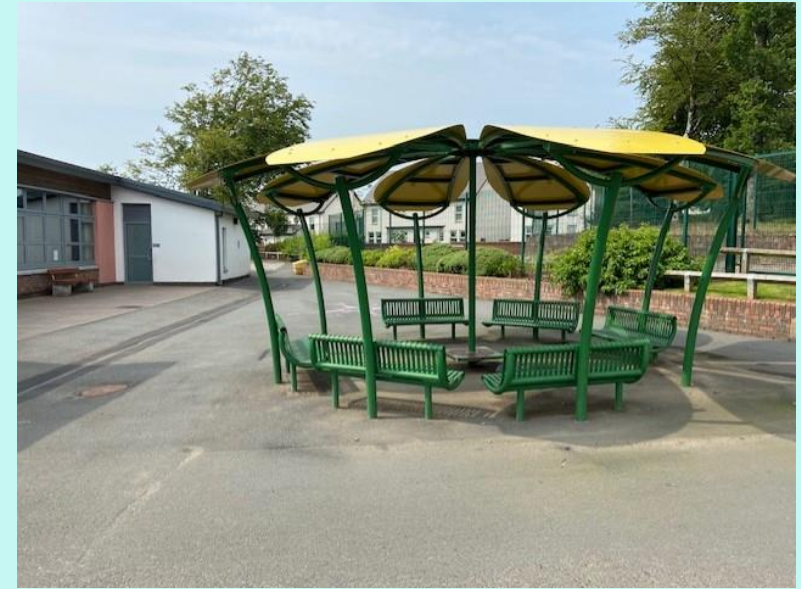
Entrance and Flower