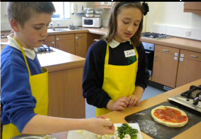
...and this pizza is gonna be good!