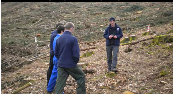
Where have all the trees gone!