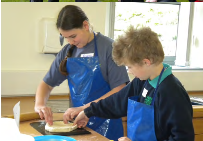
Many fingers make good pizza