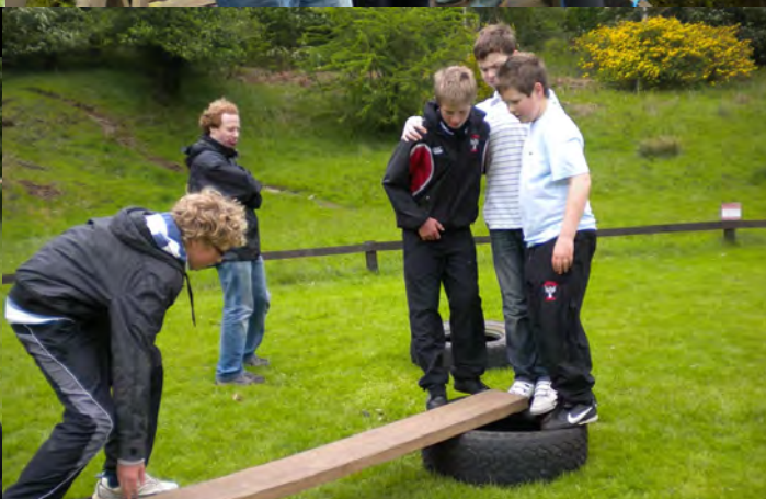
... but first they had to walk the plank